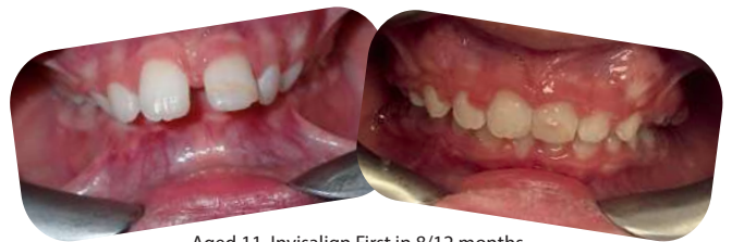
Aged 11, Invisalign First in 8/12 months