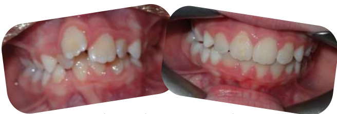
Aged 10, Invisalign First in 8/12 months