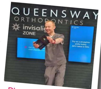
Diamond Apex provider

Invisalign offers the most discreet method to straighten your teeth, especially ideal for adults who may feel self-conscious about wearing traditional braces. This innovative system provides the same effective results as fixed braces but with nearly invisible aligners. Many of our Invisalign® patients even report that others rarely notice they're wearing them! Tailored specifically to the unique needs of our patients, Invisalign represents a ground-breaking clear aligner system. Crafted from durable, clear plastic, these aligners snugly fit both the top and bottom rows of teeth, guiding them gently into a straighter position without the appearance of metal brackets.