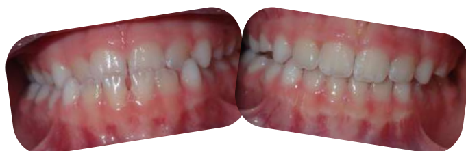
Aged 9, Invisalign First in 6 months